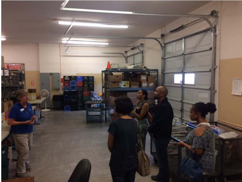
World Changers and Northlands Tour of the Co-op